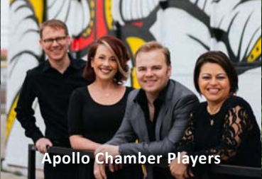
Apollo Chamber Players